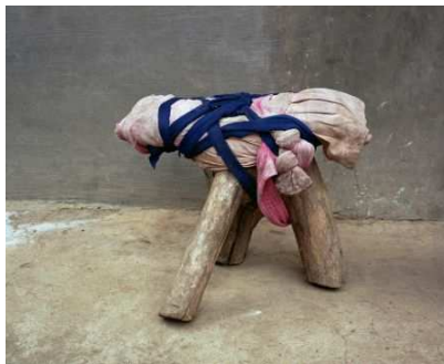
„Sitting in China“ : Still life Stool in wenzhou village, Zhejiang province, 1998