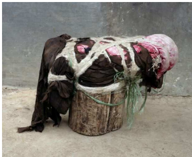
„Sitting in China“ @Michael Wolf: Still life Stool in wenzhou village, Zhejiang province, 1998