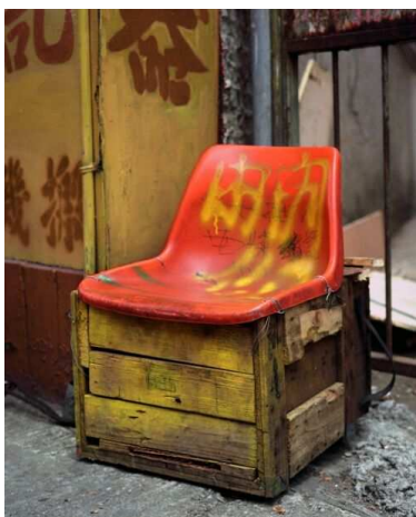
„Sitting in China“ : Still life Box chair in Hong Kong 2003