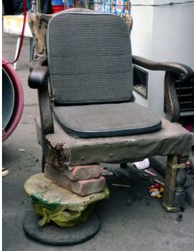
„Sitting in China“ Still life Bastard chair, Beijing 1998