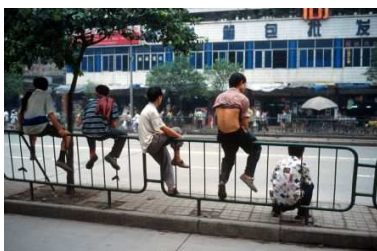
„Sitting in China“ : Journalistic photograph Sitting on a fence by the road side in the city of Chengdu 1999