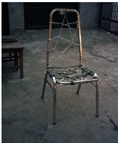
„Sitting in China“ @Michael Wolf: Still life Improvised chair, Beijing 1999

Exciting and provoking contribution to the Passagen 2006: The KAP Forum in the KAP am Südkai is showing the exhibition and installation project, “Sitzen in China – Sitting in China”, by World Press Award prize-winner Michael Wolf