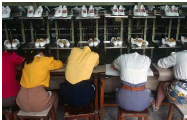
„Sitting in China“ @Michael Wolf: Journalistic photograph Workers in a shoe factory in Guangdong province taking a break at their workplace, Guangzhou 1994