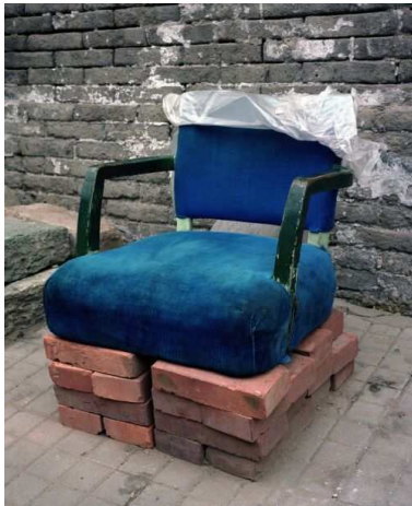
„Sitting in China“ : Still life Brick chair in Beijing, 1999