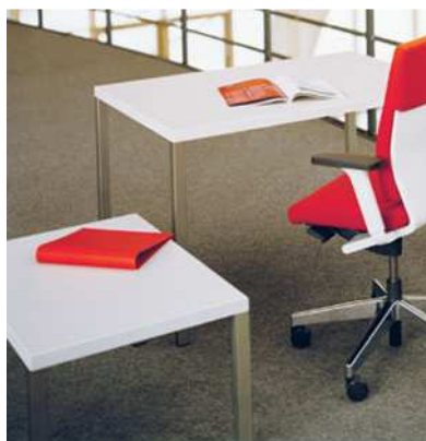
DinA Office range: 1/1 table, 1/2 table, 1/4 table and three functional heights offer simple and fascinating furnishing concepts for any application requirements.