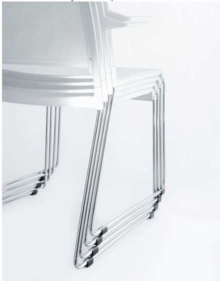
Aline range (design: Andreas Störiko): easy, compact storage of up to 15 chairs, with each one adding only 20 mm to the height of the stack

Further information and high resolution print data available at www.wilkahn.com - Service- Image Database – search word "Aline"